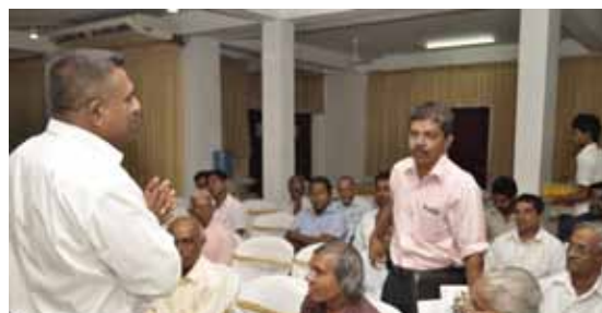
Galle: October 07, 2014 Provincial correspondents at the event.