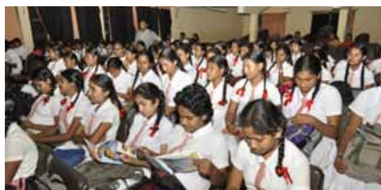
Anuradhapura: October 17, 2014 Students at the event.