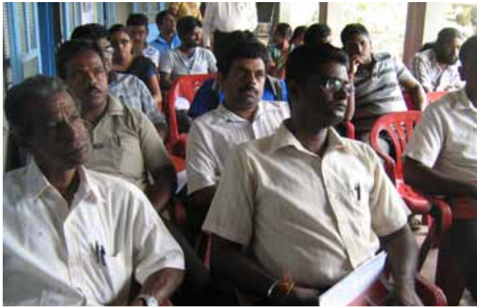
March 17: A section of Jaffna journalists listen to the amended Code explained by PCCSL.