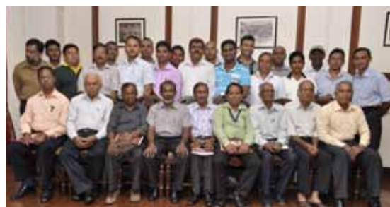
Kandy: October 04, 2014 Sinhala language provincial correspondents at the event.