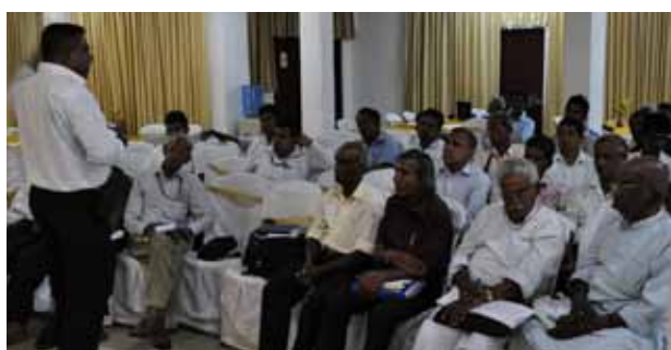
Galle: October 07, 2014 Provincial correspondents at the event .