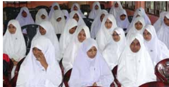
Sixty eight students and teachers attended a one-day workshop on Media Studies organised by the PCCSL for some Mawanella Schools on September 10 at the Mawanella Zahira National School Auditorium. The programme was organised by the Zahira National School, Mawanella, Media Unit.