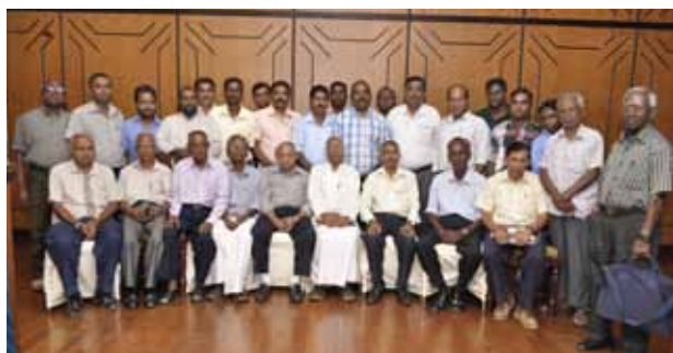
Kandy: October 04, 2014 Tamil language provincial correspondents at the event.

The Sri Lanka Press Institute (SLPI) conducted three awareness workshops to Provincial Correspondents on Right To Information (RTI). The training objective was to bring in the much needed awareness to the journalist about RTI, its benefits and the present position of the RTI in Sri Lanka. Awareness workshops were conducted in Kandy, Galle and Anuradhapura. The awareness programme was also extended to citizens in partnership with the PCCSL. The PCCSL also conducted awareness programmes on the Code of Professional Practice in all the three locations.