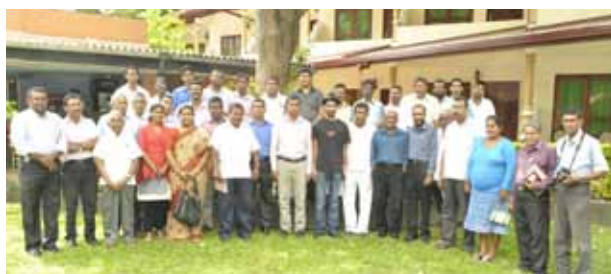
Anuradhapura: October 17, 2014 Provincial correspondents at the event.